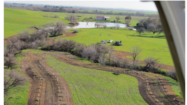
Riparian restoration at Yanci Ranch.

Planning and management of on-farm restoration and habitat conservation projects in Yolo County's agricultural community, in partnership with the Center for Land-Based Learning and Putah Creek Council.