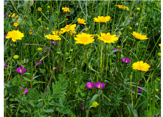
Woolly sunflowers and Red Maids in the North Davis Upland Habitat Restoration Site.

Habitat restoration management on Delta properties in coordination with the Department of Water Resources and Reclamation Districts.