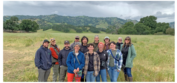
RCD staff at Bobcat Ranch in May 2023 touring past rangeland and habitat restoration projects and discussing future pollinator and wildfire projects.

The Yolo County Resource Conservation District (RCD) has accomplished a number of successes in improving water quality, addressing water conservation issues in urban and rural areas, preserving and restoring habitat, and developing new ways of achieving conservation goals. By using a model of cooperation and voluntary action instead of regulation, the YCRCD is able to solve complex local, regional, and statewide issues under four program categories: Community Wildfire Planning, Farm and Ranch Technical Assistance, Open Space Lands Management, and Planning, Monitoring and Studies. Our major projects and programs that have furthered Yolo County RCD's goal of promoting voluntary land stewardship include: