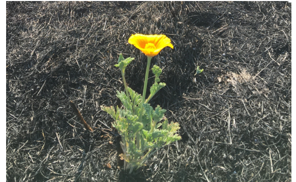
California poppy blooming after LNU Fire 2020.

On-farm restoration and habitat conservation projects in Yolo County's agricultural community, in partnership with the Center for Land-Based Learning, Putah Creek Council and Point Blue Conservation Science.